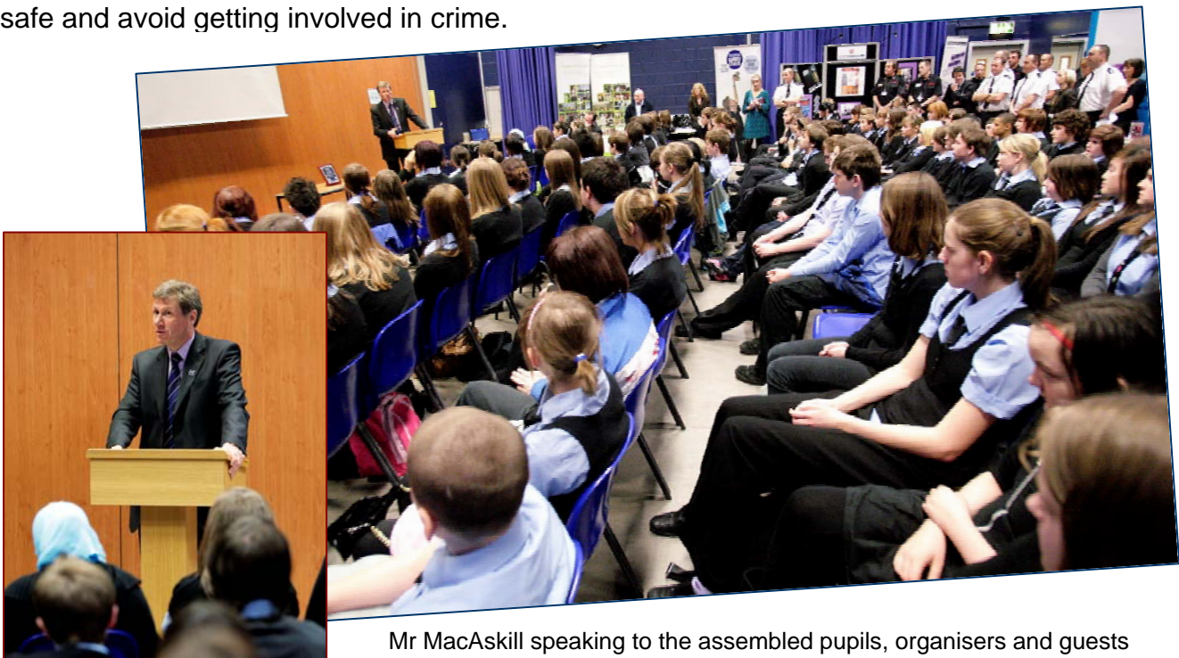
Mr MacAskill speaking to the assembled pupils, organisers and guests