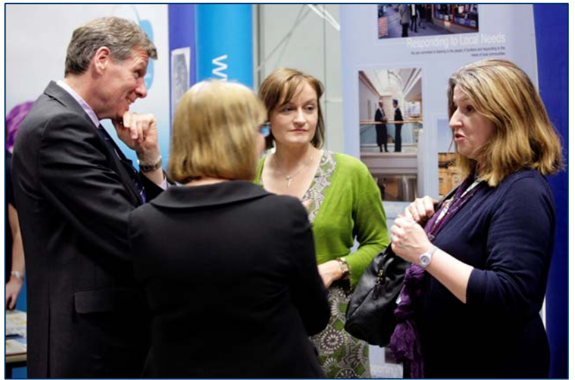
Mr MacAskill meeting the Procurator Fiscal team